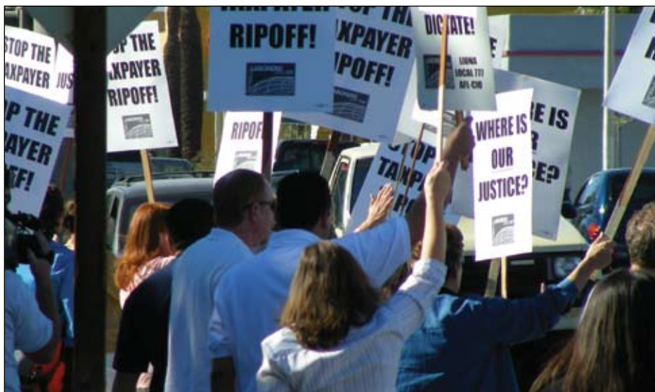
Local 777 members protesting at Court facilities in Indio on December 6.

When the Superior Court of California, Riverside County, notified Local 777 members working in the Court that they were going to UNILATERALLY impose a new health insurance plan, no one could believe it! The Court implemented this plan without notifying or bargaining with the Union and Local 777 has filed several Unfair Labor Practice charges.