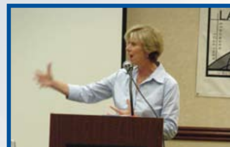
Janice Hahn, L.A. City Council-member, speaks on the need to keep Airport Police separate from LAPD