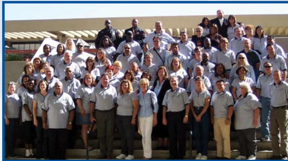
Thank you Local 777 stewards who attended!