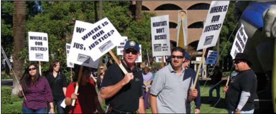
Protesting at Riverside Superior Court on November 30.